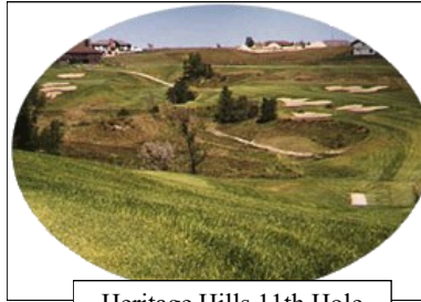
Heritage Hills 11th Hole

Heritage Hills offers a challenging and unique golfing experience. This annual event promotes Community Hospital and Southwest Nebraska.